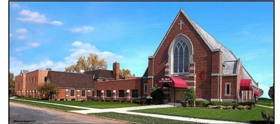
Bringing the Gospel of Christ to Life